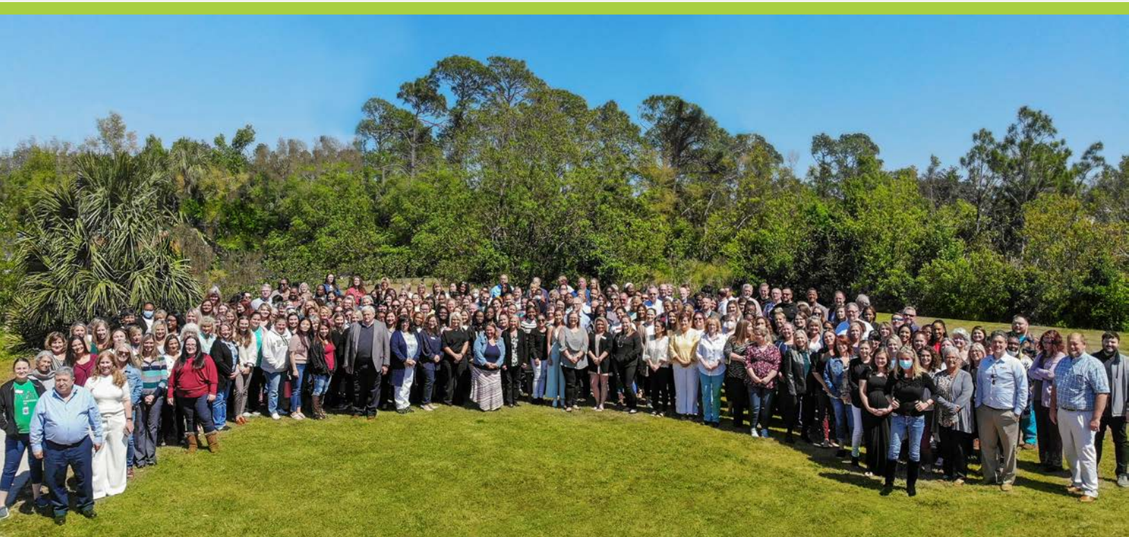
2021 PanCare Staff Photo

Serving Bay, Calhoun, Franklin, Gadsden, Gulf, Holmes, Jackson, Liberty, Walton & Washington Counties