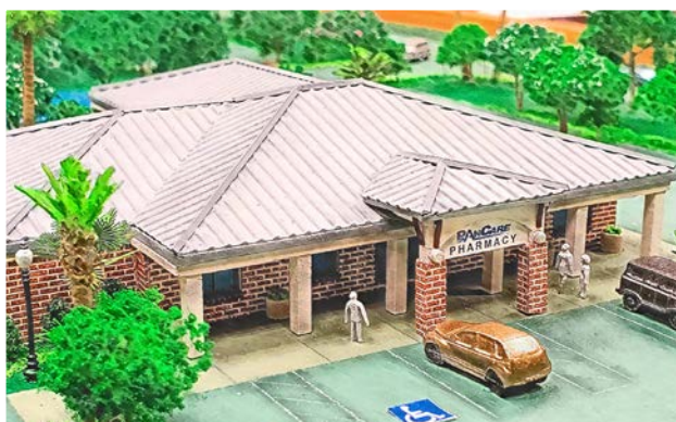
Pharmacy & Optometry

This project will cost approximately 30 million dollars. Seeking funding sources to make this Healthcare Center an expedient funding approval, we hope to have the