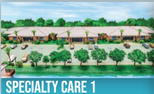
SPECIALTY CARE 1