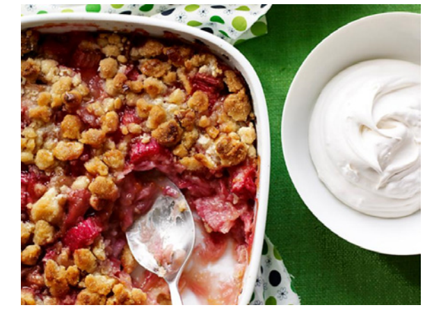
Easy to prepare recipe for rhubarb lovers everywhere!