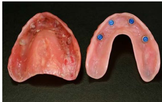
Old denture next to smaller implant supported overdenture.