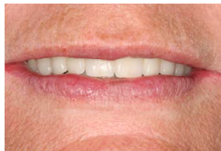
She absolutely is thrilled with her new teeth.