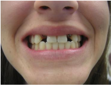
Young girl two missing teeth.