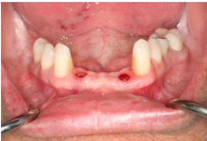
Two implants beneath the gum.