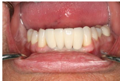
Four missing teeth replaced with two implants.