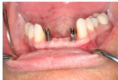
Two abutments into the implants.