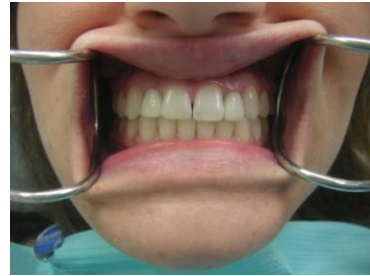
She is so happy now.