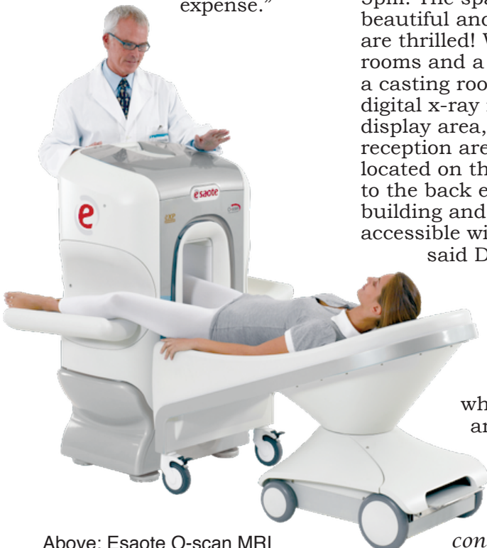
Above: Esaote O-scan MRI

According to the U.S. Energy Information Administration, healthcare facilities are one of the top five commercial building energy consumers. This is attributed to being open on a 24/7 basis, specialized equipment (such as CT scanners and MRIs) that are in use on a constant basis, and heating, ventilating, and cooling systems that contribute to high utility expense."