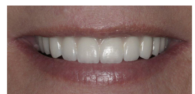
Builds back smile