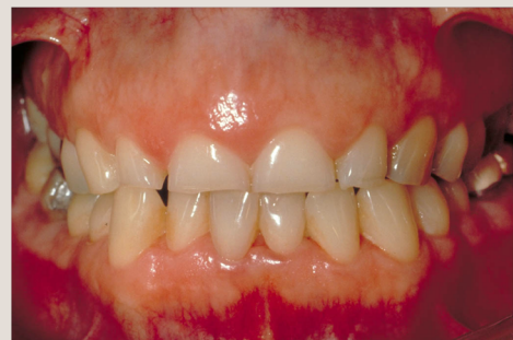
Wear from grinding