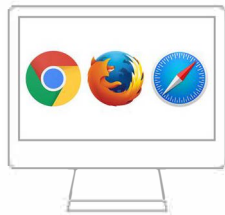
PC and Mac Chrome | Firefox | Safari

1 Use a computer or device with camera/microphone