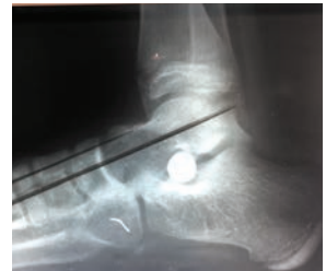
STJ Implant (PostOp)