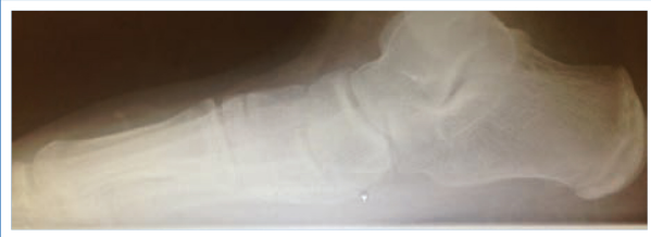
Pediatric Flatfoot (PreOp)