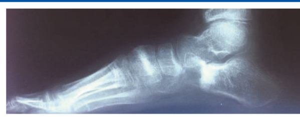
Flatfoot PostOp (Evans Calcaneal Osteotomy)