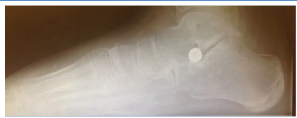
Pediatric Flatfoot (PostOp) Cotton Osteotomy with STJ Implant