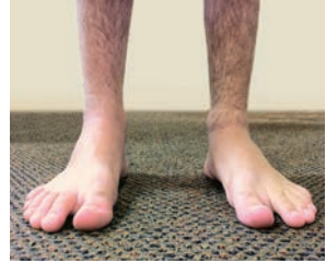
STJ Implant (PostOp)