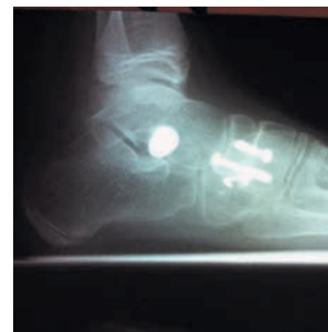
TAL, STJ Implant and Midfoot Fusion (PostOp)