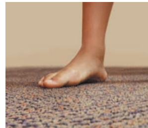
TAL, STJ Implant and Midfoot Fusion (PostOp)