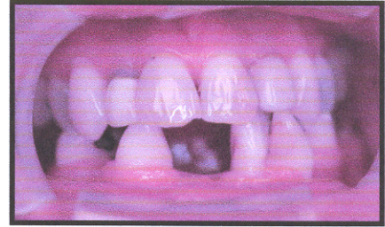
Discolored and Missing Teeth