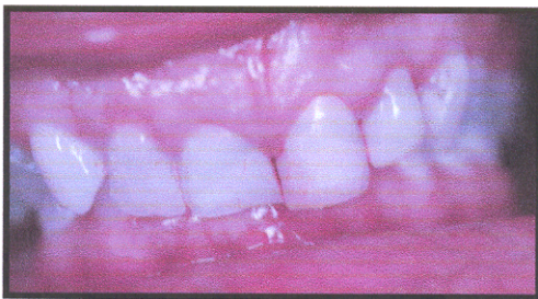
Worn, Discolored Teeth

Is there anything you would like to accomplish in your life by changing your smile?