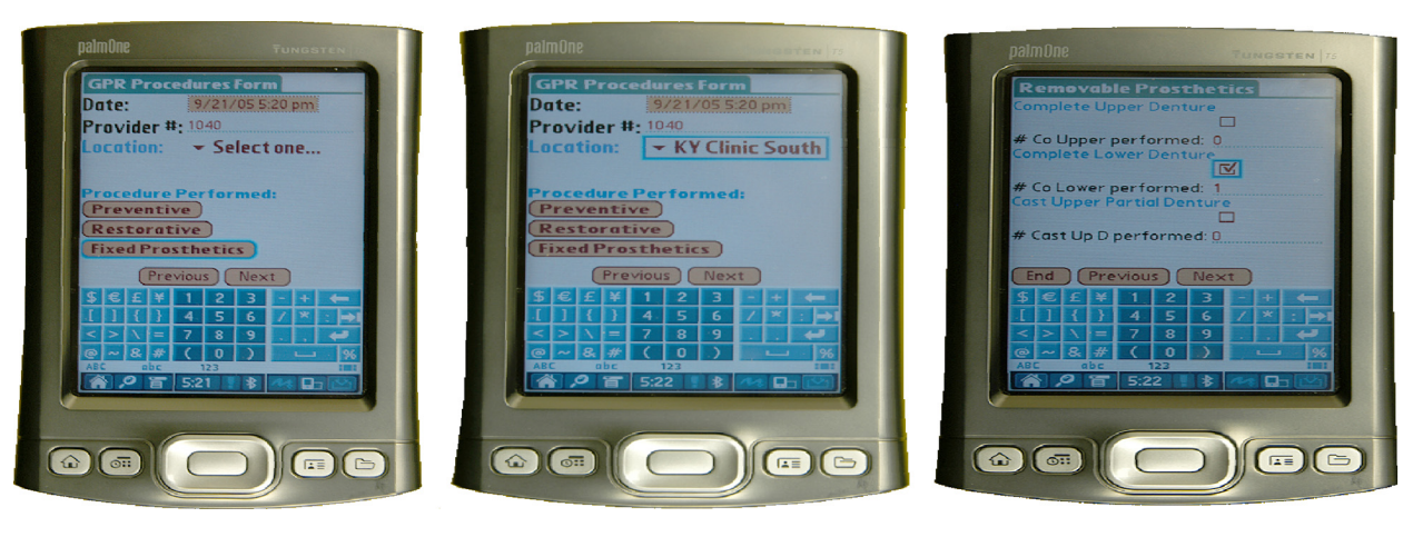
Forms 5.0 Menu Screen

send the information to the university database. If the resident opted to sync from home, a special set of programs—such as virtual private network (VPN) software—had to be installed on his or her home computer. VPN software provides a secure private communication network over the Internet that ensures the secure transmission of data. All procedural data were transferred from the Palm into a secure enterprise-level Microsoft SQL database server by using an Internet connection. Pendragon Forms enable the user to select any database of choice to store the data as well the capacity to export the data to any report-