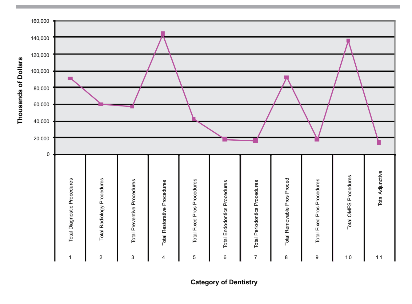
Figure 3. Generated revenue by discipline for GPR class of 2004-05

never before using Palm handheld computers. Each resident attended an instructional class during resident orientation pertaining to the basics of handheld computing, extensively focusing on the proper use of the software designed to record clinical procedures. The first difficulty some residents reported was not maintaining the battery's charge so that the handheld unit "died" and the recording software had to be reloaded by the Palm coordinator. After further investigation, it was determined that the battery did not maintain a charge because the residents failed to regularly charge their Palm handheld, not due to a hardware failure. At times it was found that residents would often go for extended periods of time without charging their handheld. By the time the resident discovered that the handheld had "died," it was too late since the handheld had sat idle for days without an electric charge, causing the memory to